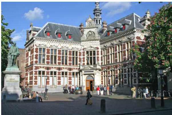
Academiegebouw Utrecht University