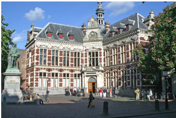
Academieggebouw Utrecht University